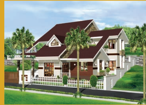
Type A • 4BHK • Total Area 2282sq.ft. Type B • 4BHK • Total Area 2098sq.ft.