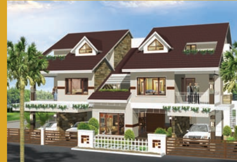
Type C - ROW HOUSE CM 1534sq.ft. • CL 1691sq.ft. • CG 1710sq.ft.