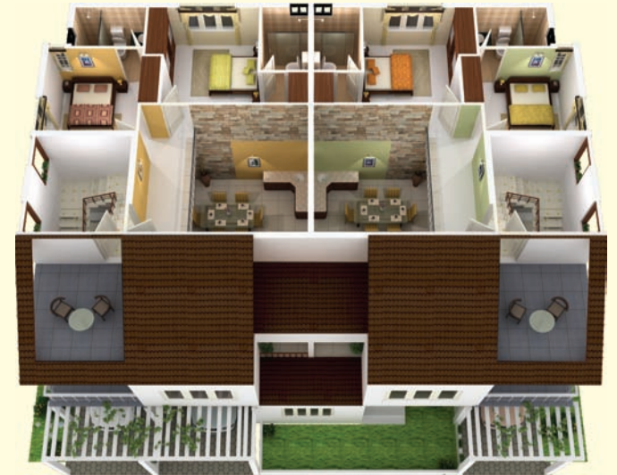
CRS - 579 sq.ft.