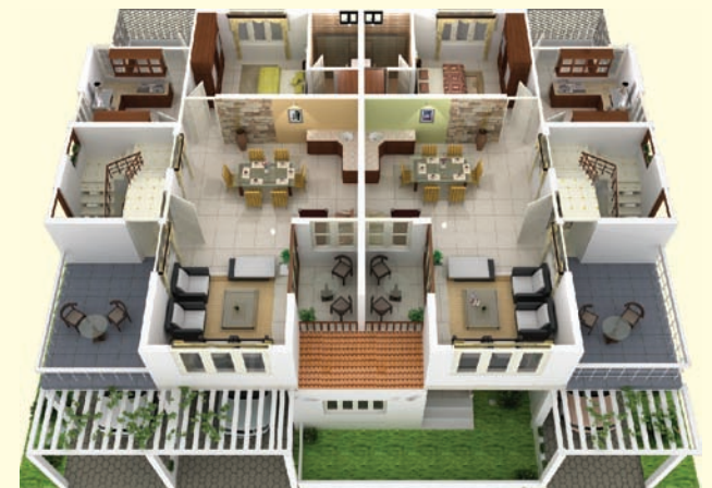
CRF - 909 sq.ft.