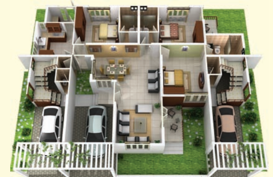
CLG - 203 sq.ft.