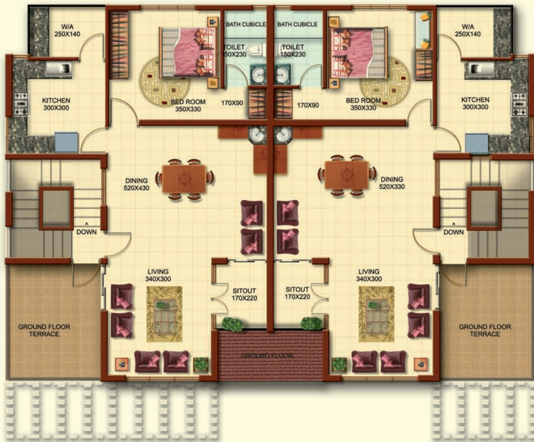
CLF - 909 sq.ft.