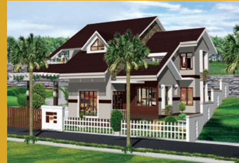
Type D • 3BHK • Total Area 1912sq.ft. Type E • 3BHK • Total Area 1643sq.ft. Type F • 3BHK • Total Area 1561sq.ft.